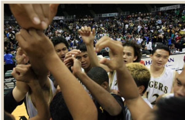
McKinley players celebrated after beating Kohala last night in the Division II title game.