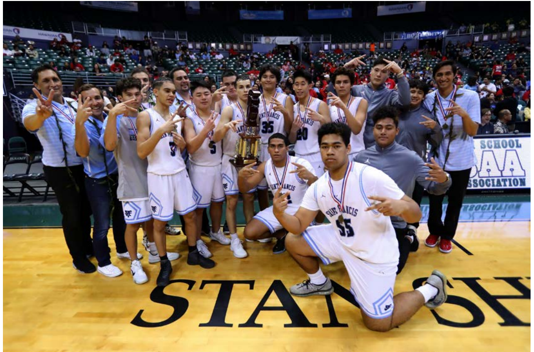
Saint Francis Saints 2018 Division 2 champions