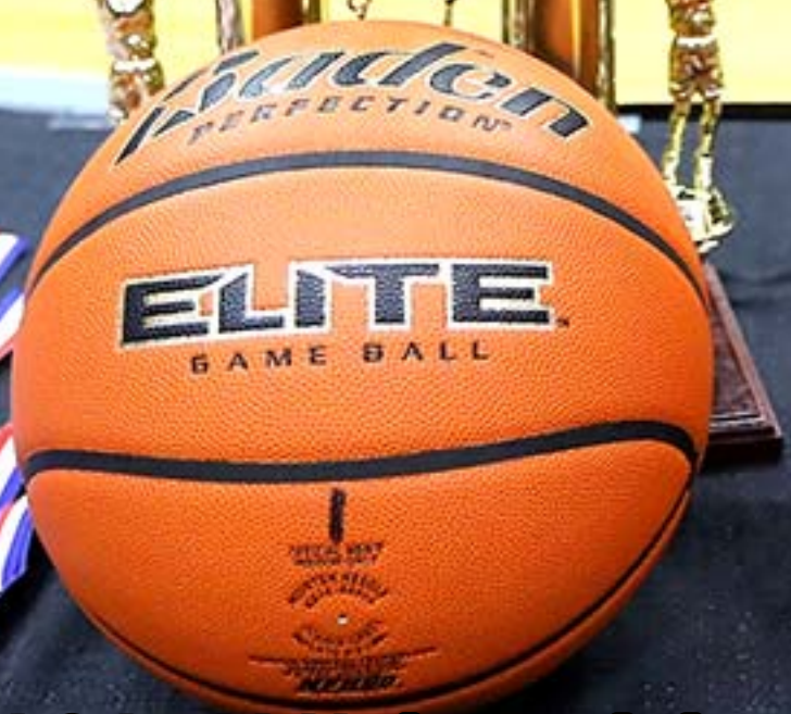
Hawaii High School Athletic Association 2019 Division II Boys Basketball Record Book