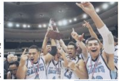
Saint Francis players celebrate the trophy in celebration of the school's basketball championship.

The top seed of the Division III boys basketball state championship, Saint Francis, made its mark on the sport by defeating #2 Kailua 39-34 in the championship game on Saturday at Neil S. Blaisdell Arena.