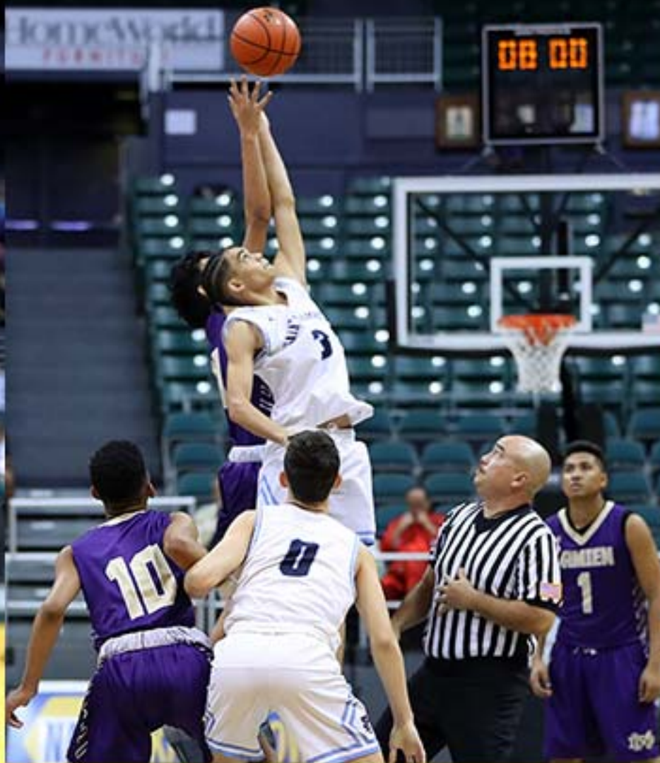
Saint Francis vs. Damien, Division II championship final