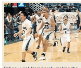
Pāhoa went from barely making the

Pāhoa was never fazed through it all. When a seven-point fourth-quarter lead disappeared in last night's title game against Kailua