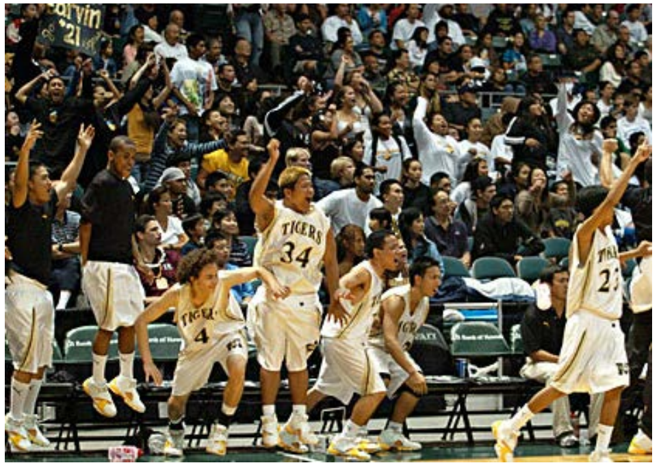
McKinley players erupt off the bench to win the first HHSAA Division II championship in 2007.