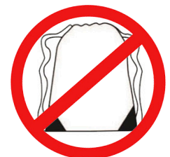
DRAWSTRING BAG Solid (Clear permitted)