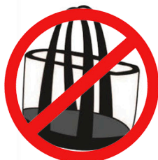
OVERSIZED TOTE BAG