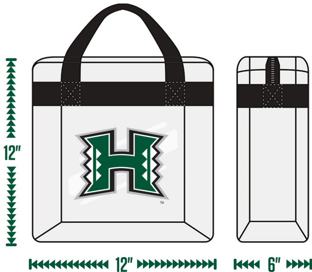
CLEAR BAGS No larger than 12" x 6" x 12"