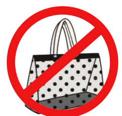
TINTED, COLORED, OR PATTERNED PLASTIC BAG