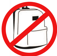
BACKPACKS Solid -OR- Clear