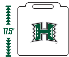
SEAT CUSHION AND SEAT CUSHION WITH BACK No pockets or zippers 17.5" or less in width